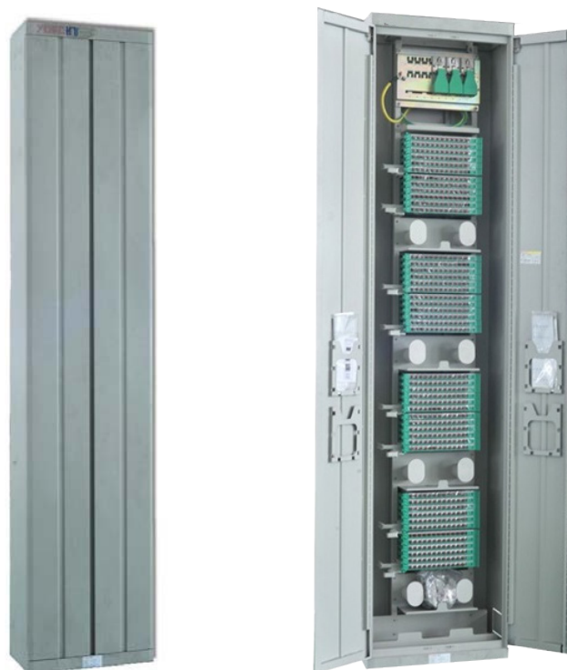
Picture 5-1 Appearance of AR-RODF-C-600 Series

Note: The frame body according to customer requirements printed content.