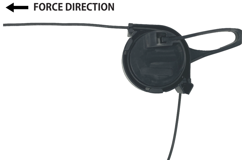
Picture of ACC tension clamp

ACC tension clamp is used for the dead-ending of 3mm to 6mm aerial round drop cables in FTTH architectures, where spans should not exceed 70m. It's designed with a mandrel shaped body enabling the roll up and self-tightening of the cable. It includes an opening bail to directly secure on pole fittings.